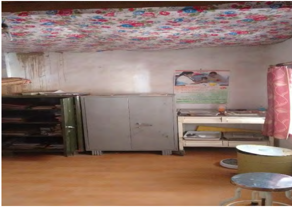
Room needs major repair