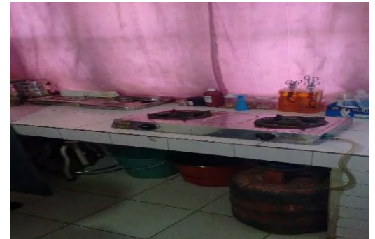
Gas cylinder and burners in LR