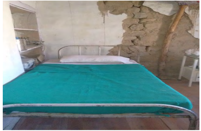
Clean bed but broken walls