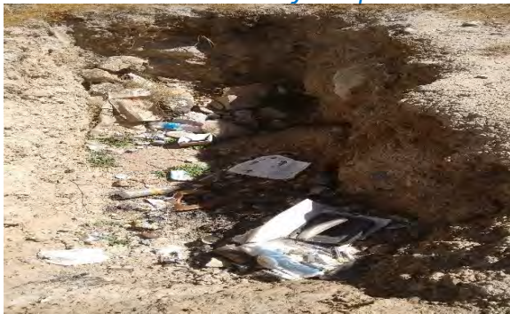
Deep Burial pit