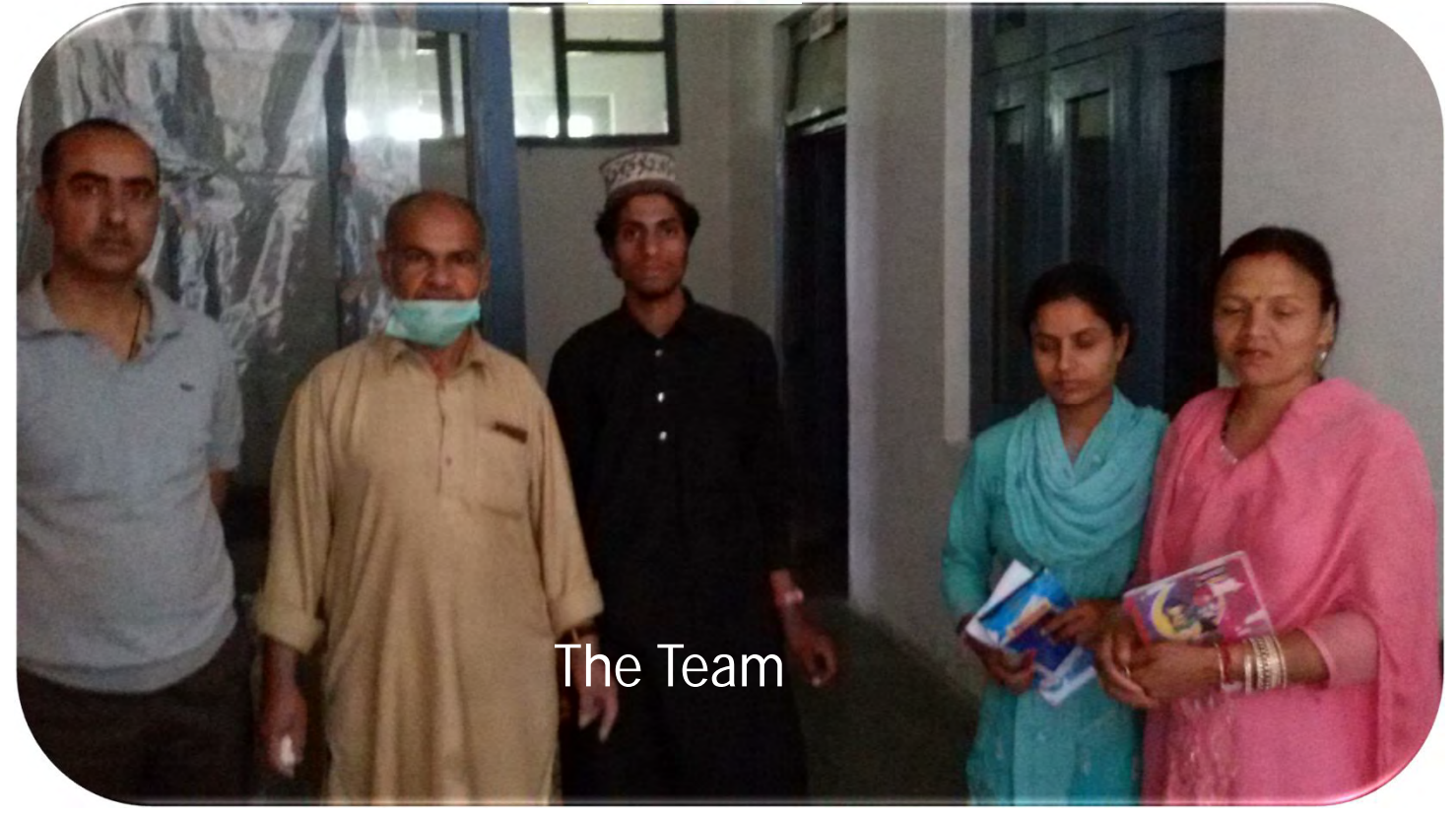
Also thankful to DMEO, DC-RMNCH+A, MOIC PHC Keruu